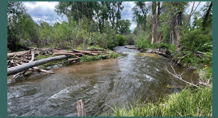
Where feasible, keeping large wood in the river helps maintain natural river dynamics and provides important fish and wildlife habitat.